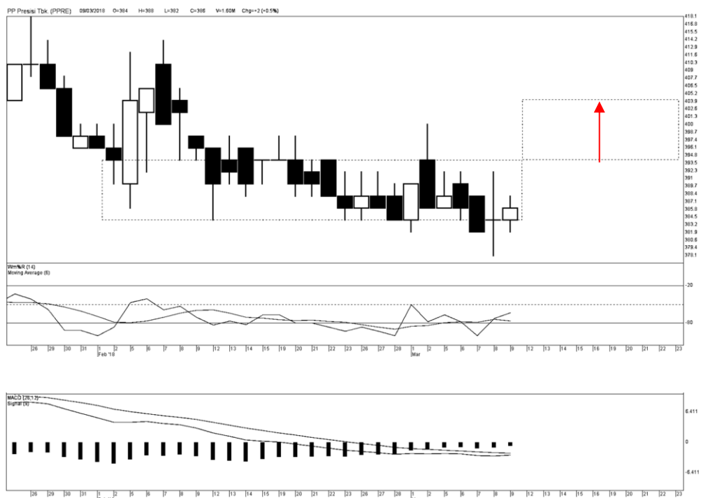
Kinerja saham PPRE